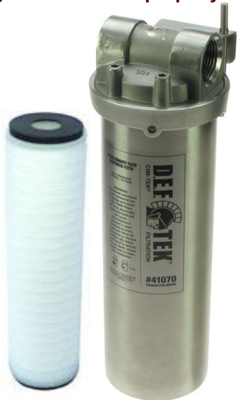
Element 5 micron CT31015